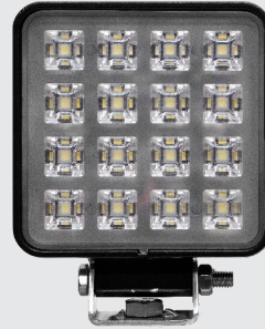
8103 WORK LIGHT