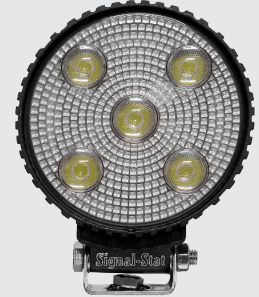
8104 FLOOD LIGHT