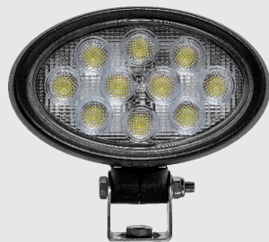
8107 WORK LIGHT