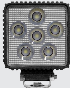
8108 WORK LIGHT