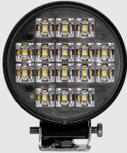
8101 WORK LIGHT

Materials: die-cast aluminum housing, polycarbonate lens, powder-coat finish, 18-gauge blunt-cut wire Connection: hardwired