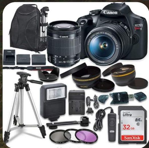
Canon EOS Rebel T7 Digital SLR Camera with Canon EF-S 18-55mm Image Stabilization II Lens, Sandisk 32GB SDHC Memory Cards, Accessory Bundle

THE THREE 1 IRF'S THAT PURCHASE THE GREATEST DOLLAR ($) VALUE 2 OF MERITOR (TDA PREFIXED) PARTS VIA EXCELERATOR DURING THE PROMOTION PERIOD AND THAT ARE ENROLLED IN INNER CIRCLE REWARDS PRIOR TO SEPTEMBER 30, 2021 WILL WIN A CANON CAMERA BUNDLE VALUED AT $575