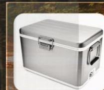
SECOND PRIZE: YETI V SERIES STAINLESS STEEL COOLER