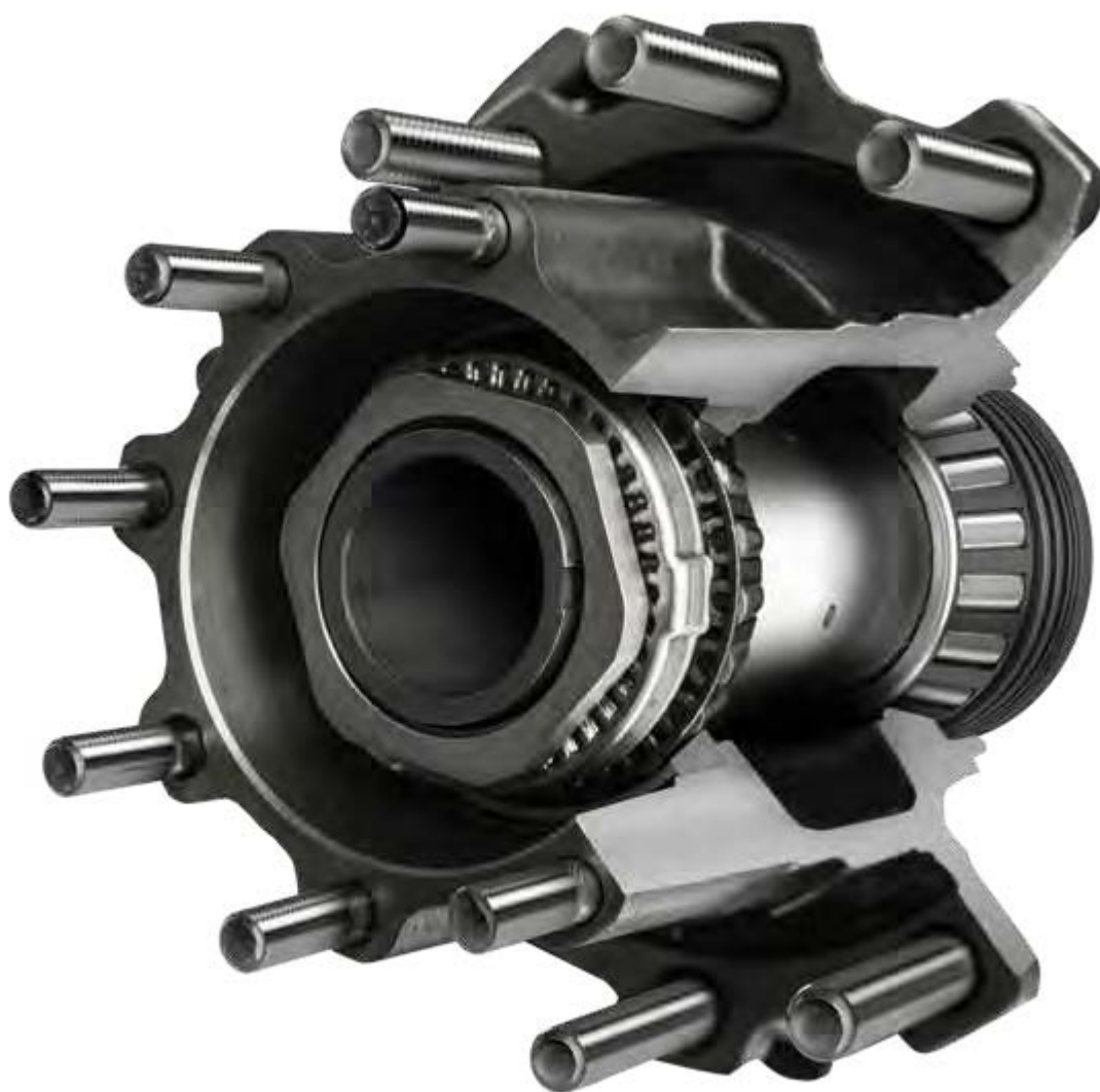
Stemco Trifecta Pre-Adjusted Hub Assembly