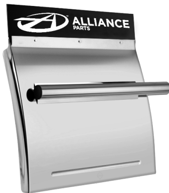
Fenders - Alliance

Suggest the following to your customers for additional sales: