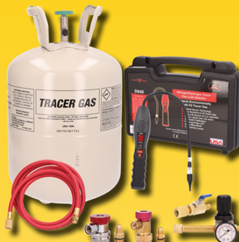
ABP N83 MT7500 Leak Detector Kit H2N2 Hydrogen 5% / Nitrogen 95% ABP N83 MT7501 Leak Detector H2N2 Hydrogen / Nitrogen ABP N83 MT7502 Gas Cylinder H2N2 Hydrogen / Nitrogen ABP N83 MT7503 Regulator Kit H2N2 Hydrogen / Nitrogen ABP N83 MT7504 Coupler H2N2 Hydrogen / Nitrogen ABP N83 MT7505 Replacement Filters H2N2 Hydrogen / Nitrogen