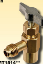
ABP N83 MT1514** Can Tap - Resealable R134a 1/2" Acme Male Thread x 1/2" Acme Female Thread