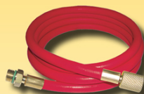
ABP N83 MT0403 72in ABP N83 MT0411 96in