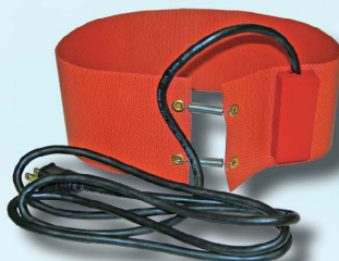
ABP N83 MT1412 Heater Blanket