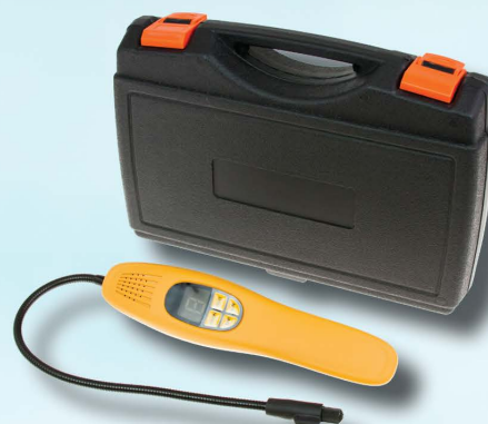
ABP N83 MT1734 Leak Detector R12 / R134a / R1234yf