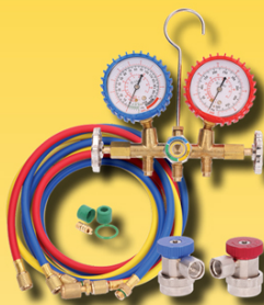
ABP N83 MT1416 Manifold & Gauge Set R134a - Brass