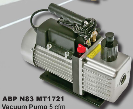
ABP N83 MT1721 Vacuum Pump 5 cfm