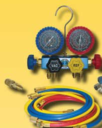
ABP N83 MT1480 Manifold & Gauge Set R134a 4-Way