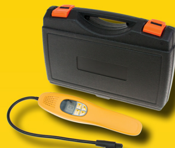
ABP N83 MT1734** Leak Detector R12 / R134a / R1234yf