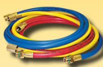
ABP N83 MT0402 72in ABP N83 MT0409 96in