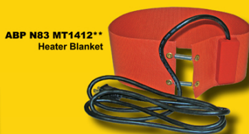
ABP N83 MT1412** Heater Blanket