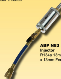
ABP N83 MT4055** Injector R134a 13mm Male QDK x 13mm Female QDK