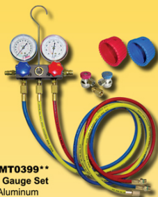
ABP N83 MT0399** Manifold & Gauge Set R134a - Aluminum