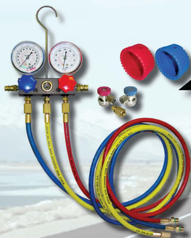
ABP N83 MT0399 Manifold & Gauge Set R134a - Aluminum