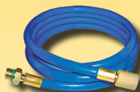
ABP N83 MT0404 72in ABP N83 MT0410 96in

R134a 14mm x 1/2" Acme Refrigerant Hoses