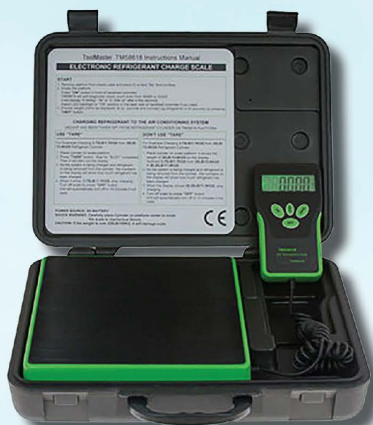
ABP N83 MT1402 Electronic Charging Scale

Every shop needs this starter kit; it contains the basic necessities for leak detection, vacuuming and charging the A/C system in any vehicle.