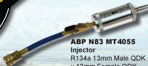
ABP N83 MT4055 Injector R134a 13mm Male QDK x 13mm Female QDK