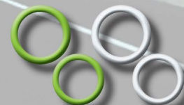
ABP N83 MT1066 Replacement Seal Kit For Couplers