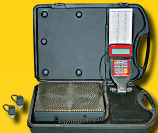
ABP N83 MT1720 Electronic Scale Programmable