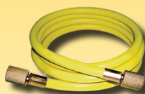
ABP N83 MT0405 72in ABP N83 MT0412 96in