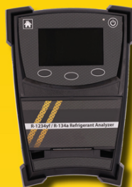
ABP N83 MT1735 Refrigerant Identifier R134a / R1234yf