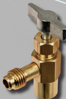
ABP N83 MT1514 Can Tap - Resealable R134a 1/2" Acme Male Thread x 1/2" Acme Female Thread