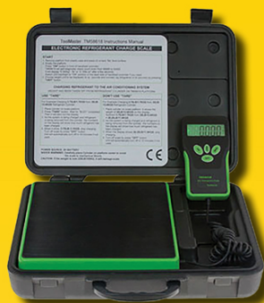
ABP N83 MT1402** Electronic Charging Scale