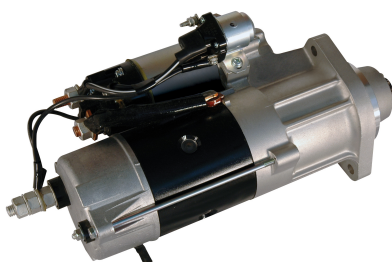
Starters - Mitsubishi Electric/Diamond Gard