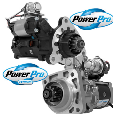
Starters - Leece-Neville

Last updated: Tuesday, 10 October 2023 01:33 PM