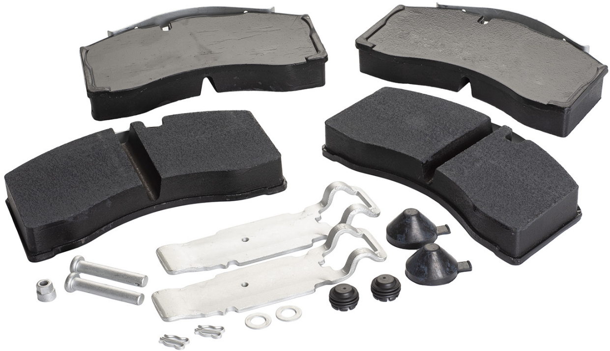
Midland Air Disc Brake Pads