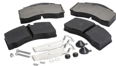
Air Disc Brake Pads - Midland