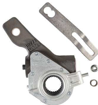
Slack Adjusters - Haldex